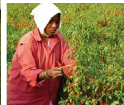
FOCUS AREA #2

The products in our portfolio are nearly 100% plant based.