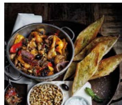
FOCUS AREA #1