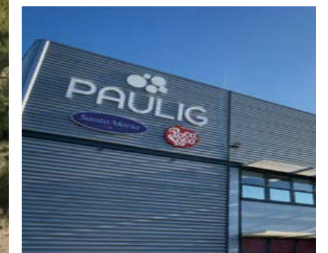
FOCUS AREA #3

All our coffee comes from verified sustainable resources and we aim to extend this work to cover other raw materials.